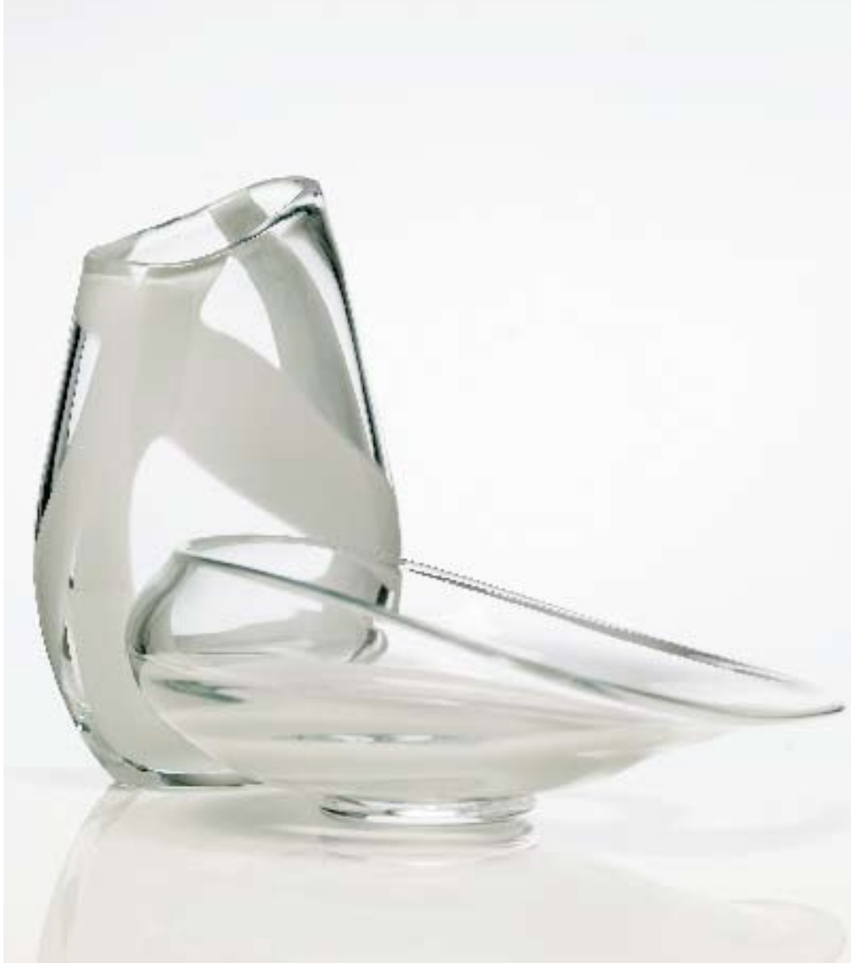
wave (main picture) by hans s

A striking vase makes a romantic Christmas present – order freshly cut flowers for the day and you can't go wrong. We've picked out some of the latest beauties by Scandinavia's leading glass designers.