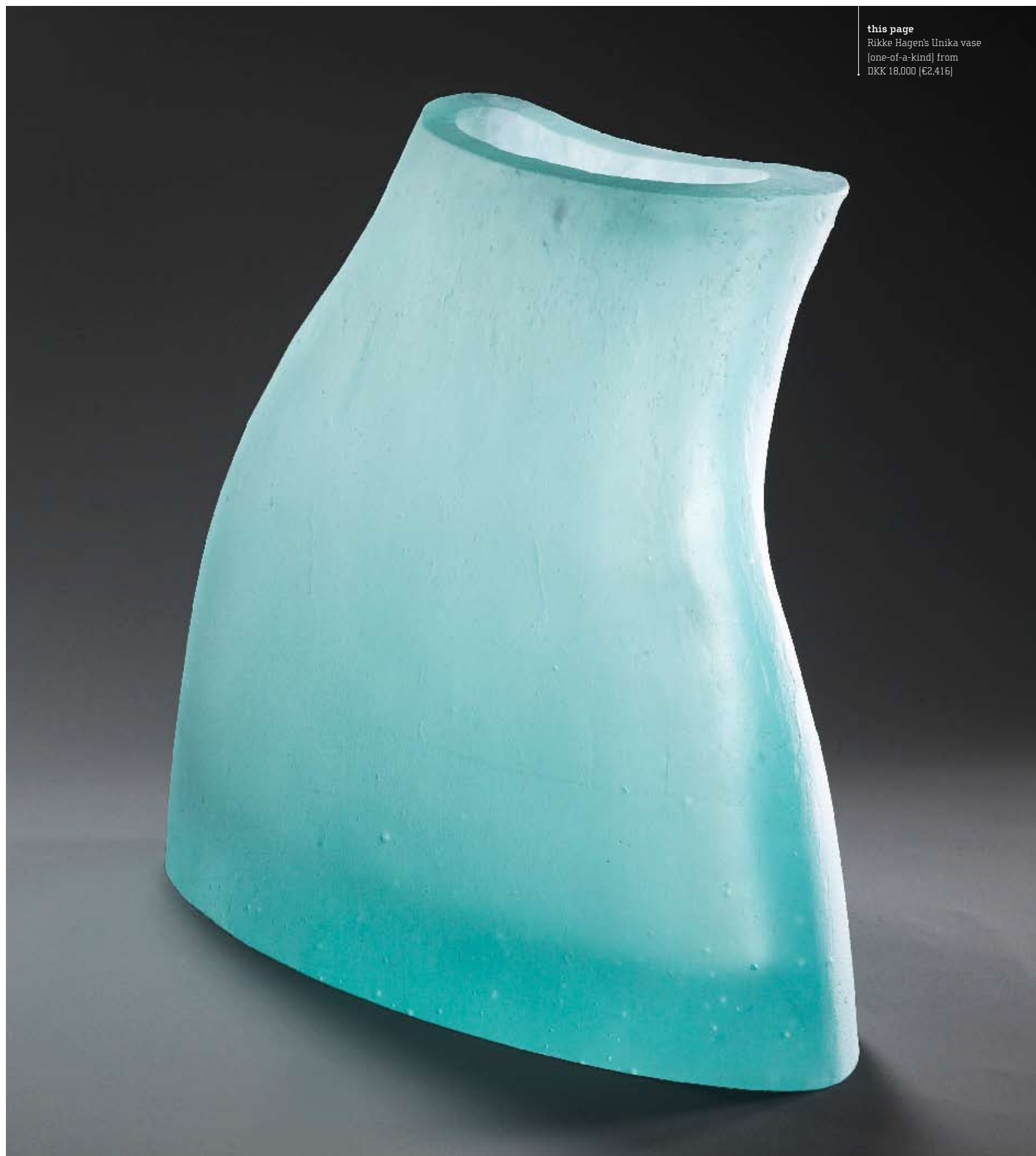
this page Rikke Hagen's Unika vase (one-of-a-kind) from DKK 18.000 (€2,416)